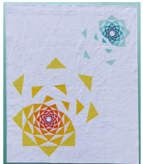
The Disintegration of the Persistence of Artichokes, using a complex block with elements moved away

Instagram, Facebook: @flyingparrotquilts